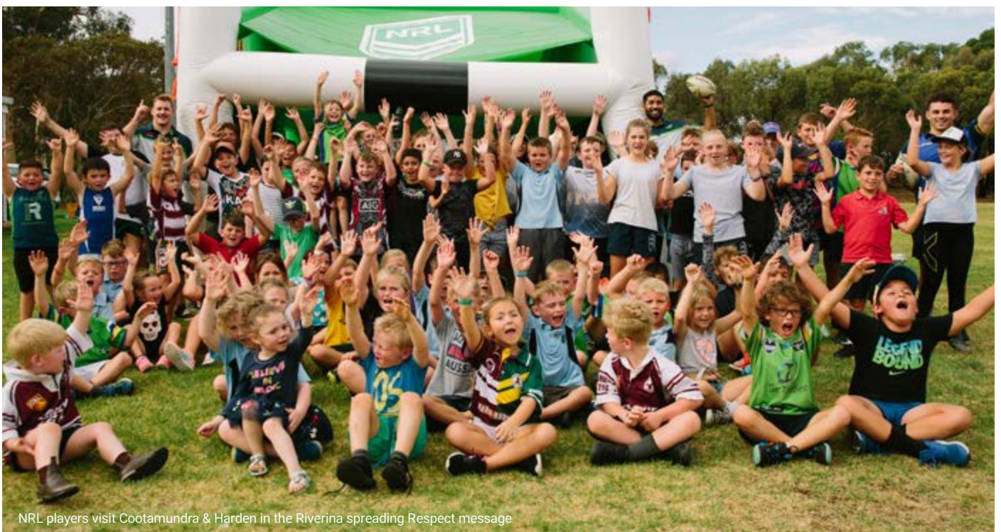
NRL players visit Cootamundra & Harden in the Riverina spreading Respect message

The expansion of the Road to Regions program was part of rugby league's whole of game response to the bushfire crisis.