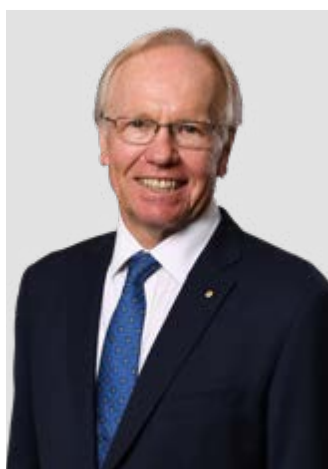
The Hon. Peter Beattie AC